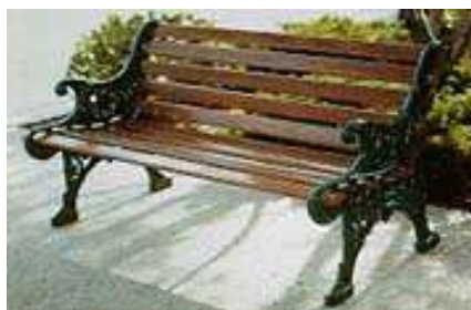
Sample of Concrete sitting tool